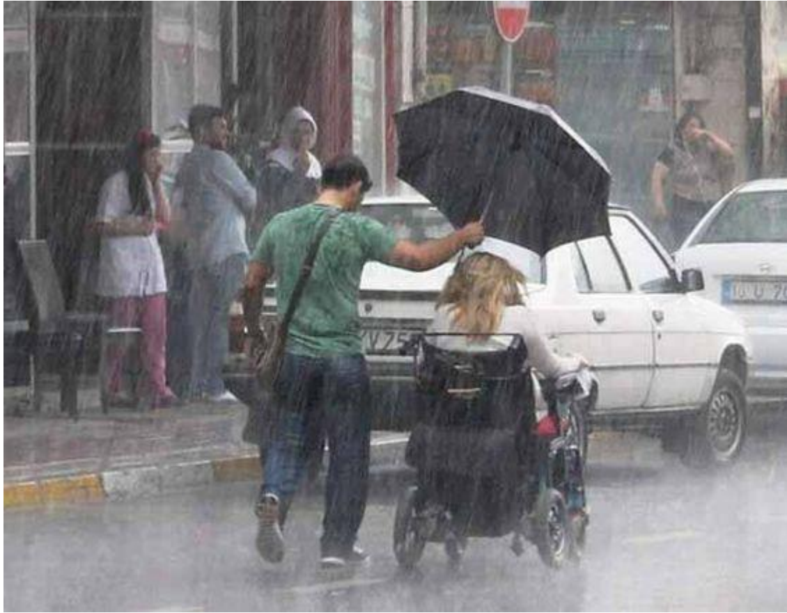
Making life better for other people