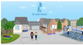
Year 1 Stuarts and Tudors